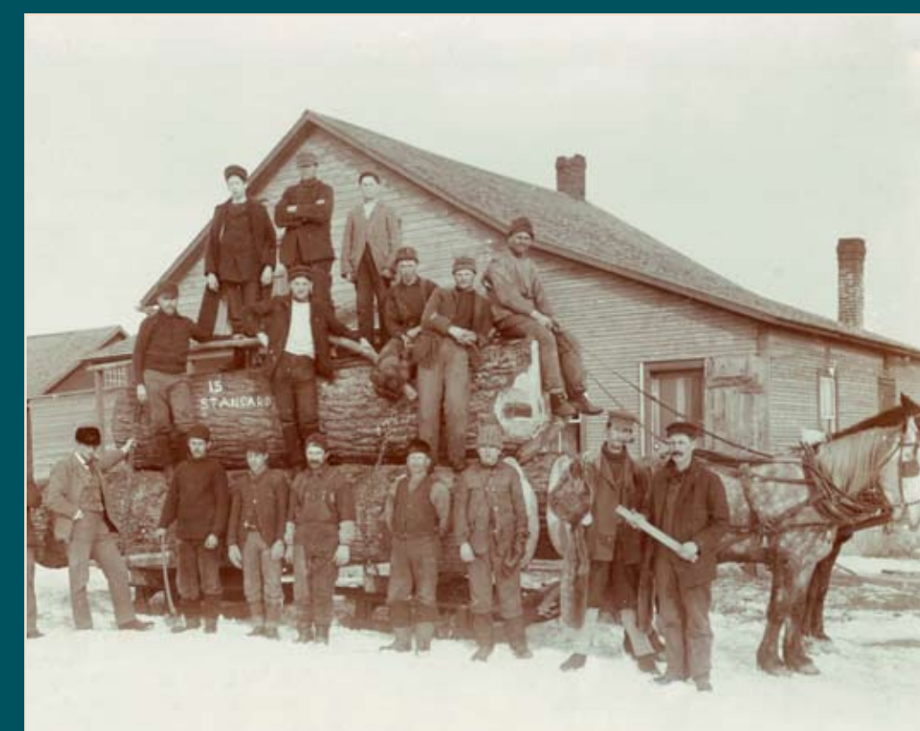
Armed with only axes and cross cut saws, farmers would head into the woods in the winter with their teams of horses to cut and haul logs back to the saw mill.