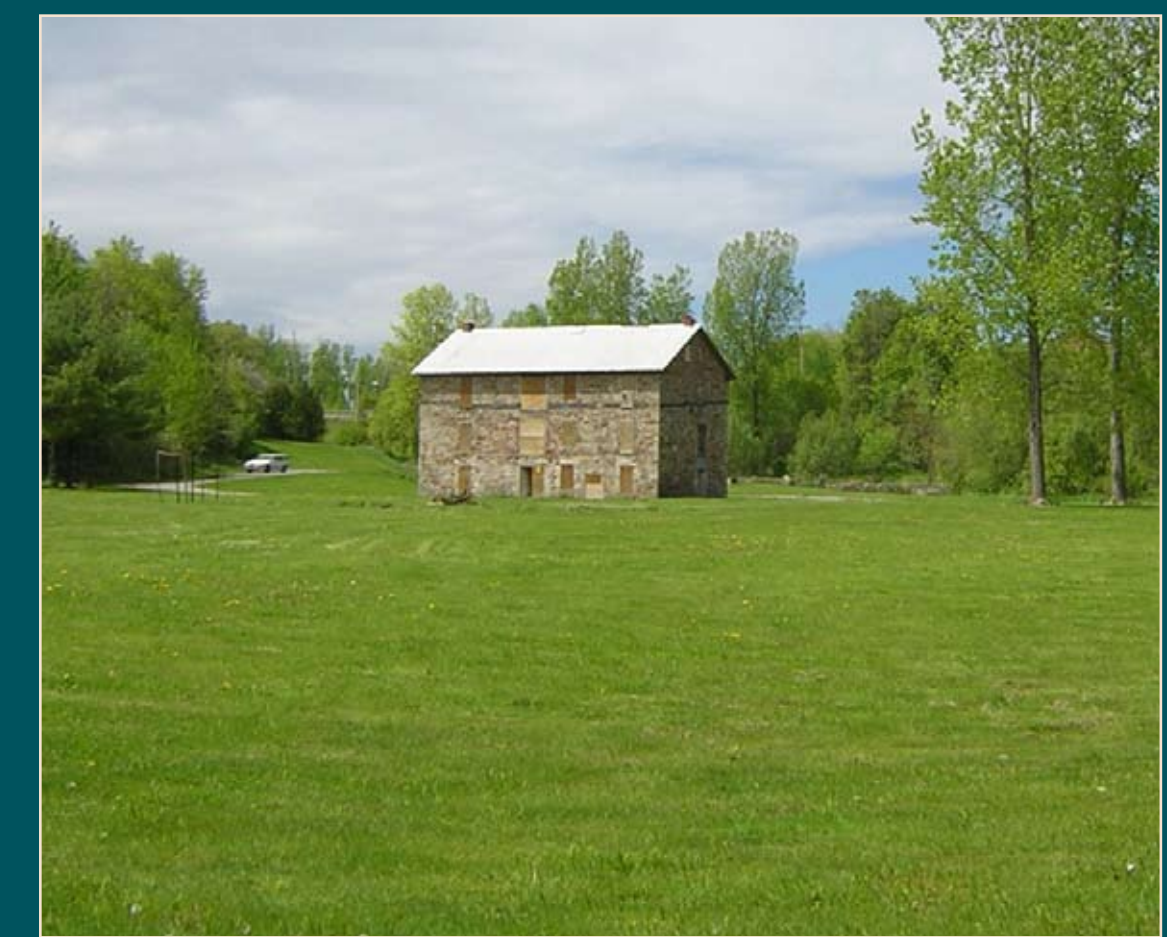
After the flood the site sits empty and quiet for the first time since 1795.