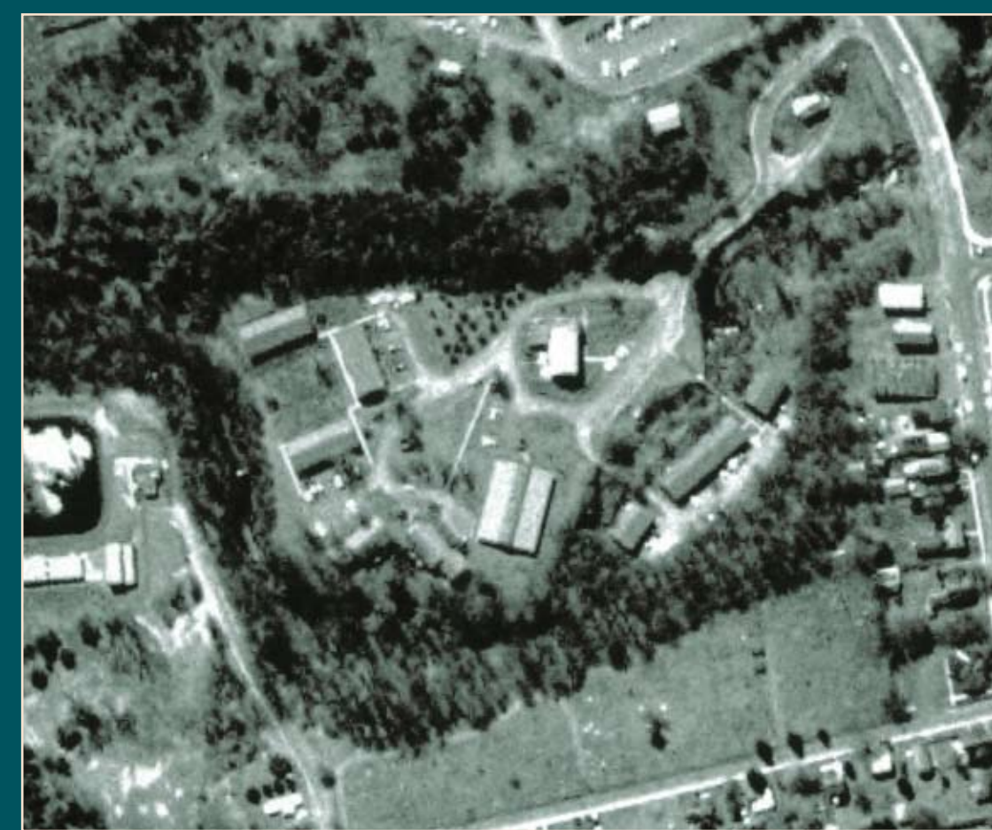
1995 aerial photo of the apartment complex.