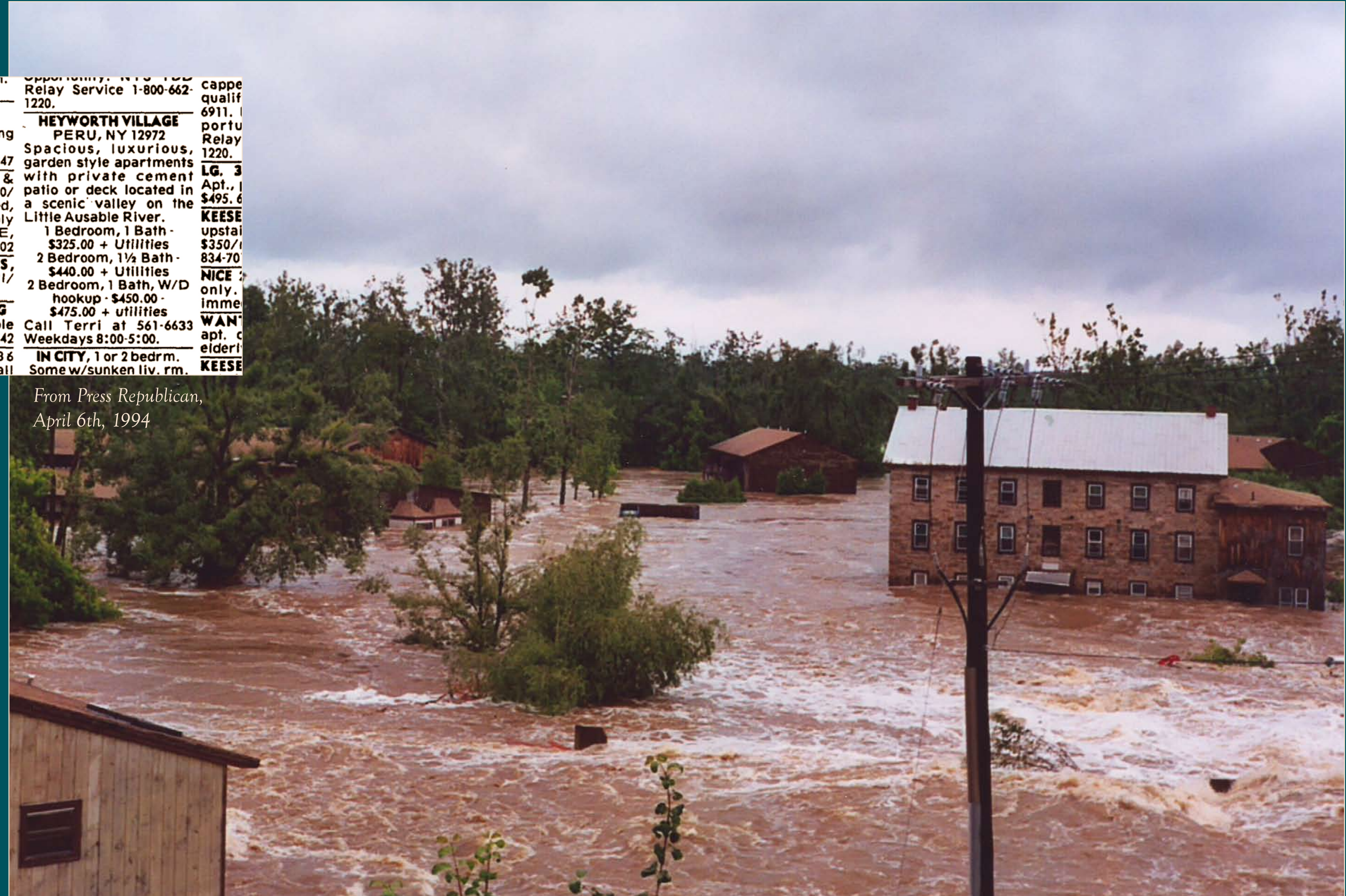
Flooding destroys Heyworth Village Apartments on Saturday, June 27th, 1998. Only the 1836 stone building survived.